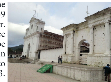
One of the buildings in the Village of Nebaj, Quiche