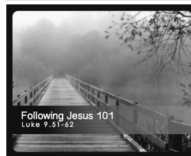
Following Jesus 101 Luke 9:51-62

For SummerFest . . . Sherri Rufer is looking for donations of meatballs in sauce, sausage & peppers, and plain cooked Italian sausage. If you're able to donate, please call her at 733-5088.